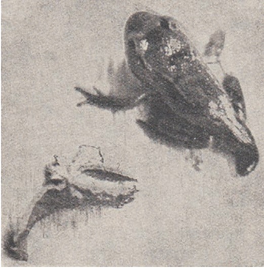
YOUNG FROG WITH ITS CAST SKIN

Chapter 4, when so many things are happening to the frog-tadpole that it is unable to eat.