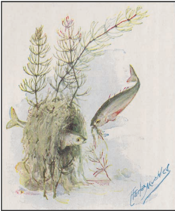
NEST OF STICKLEBACK

are fish which have a special pocket of skin in which to carry the eggs. The common Pipe-fish (which you may see at the Zoo, or sometimes at the fish-shop, or in nets at the seaside) is one of these fish with pockets. Another queer fish, to be found in tropical seas (and also at the Zoo!) carries the eggs in its mouth and gills, until they hatch! Needless to say, this fish is content with a small family of 20 or 30.