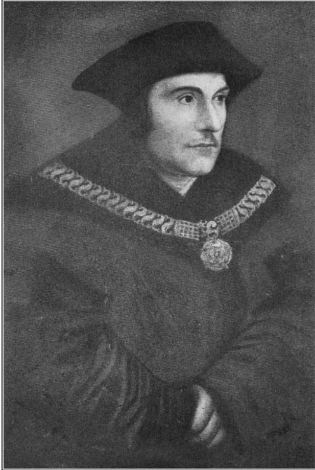
SIR THOMAS MORE

From the Painting after Holbein in the National Portrait Gallery